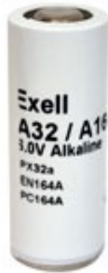
Industry Standard Dimensions mm (inches)